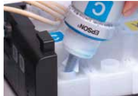
Smart tip design for easy, mess-free refills