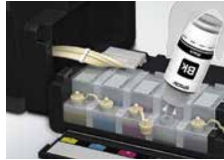
Specially fitted tubes ensure reliable ink flow without leakage

Epson's original ink tank system is designed for smooth, no-mess operation in corporate and SOHO environments.